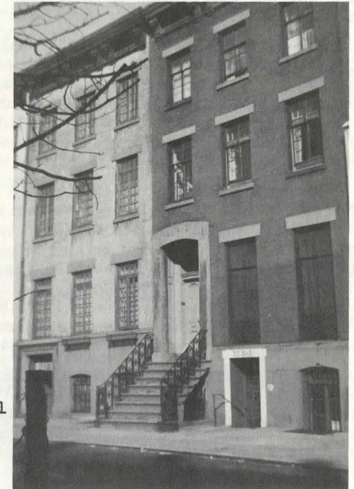
CDS NATIONAL HEADQUARTERS