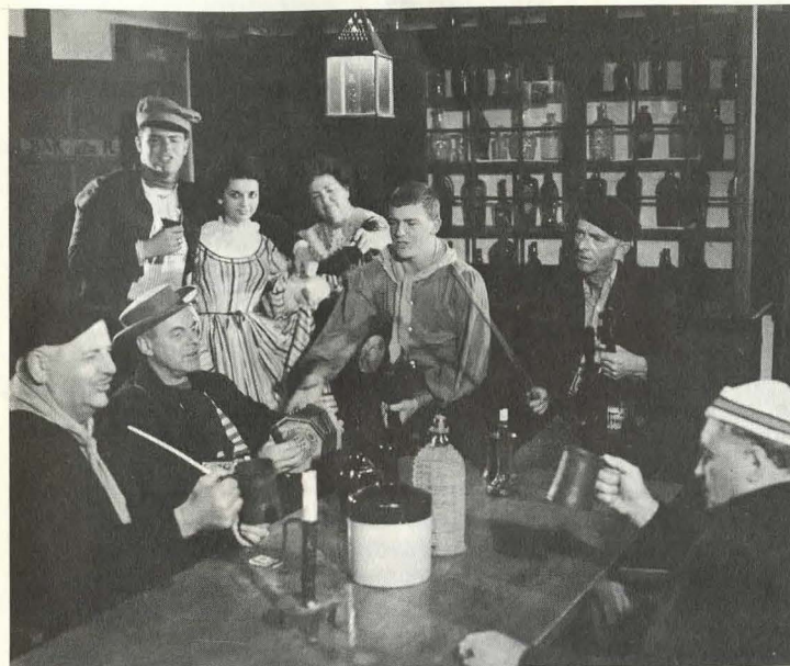
WHALING SHIP DAYS