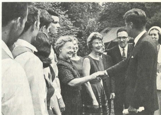
PRESIDENT KENNEDY WELCOMES THE GROUP