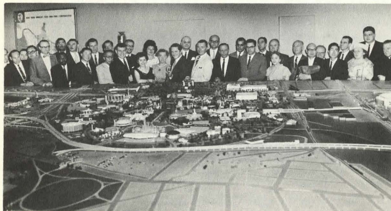
Nationality Day representatives look at model of New York World's Fair 1964-1965

The accompanying photograph shows the large number of delegates who attended the meeting, in addition to officials of the Fair. Plans are being very well worked out and we shall have more news for our members later. As soon as dates are fixed, we will let you know.