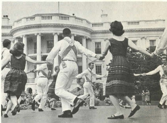
KENTUCKY RUNNING SET APPALACHIAN MINS