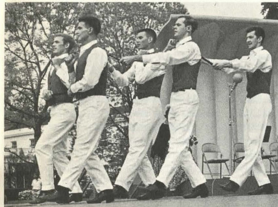
MORRIS DANCE LEAP FROG