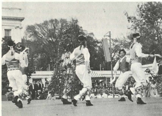
SWORD DANCE NEWBIGGIN